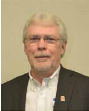
Gary Morse Royal LePage Atlantic