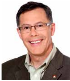
Charlie Pace Complaint Review Committee