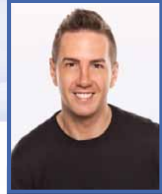
CLINTON WILKINS CENTUM HOME LENDERS LTD.

The Education Committee is the Commission's newest standing committee and was struck in the fall of 2019. The first action of the committee was to survey the industry about licensing and continuing education. Based on the results of that survey, the Education Committee moved forward on a number of initiatives in 2020.